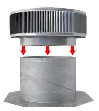
*Base not included