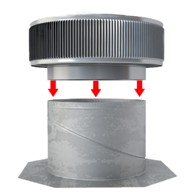
*Base not included