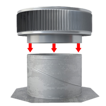
*Base not included