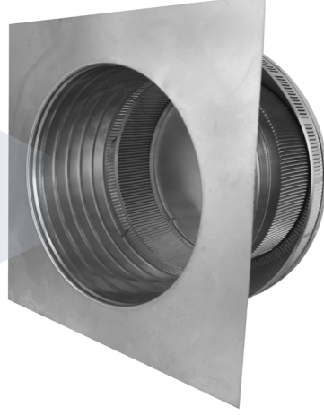
Dimensions & Specifications 113 Sq. in. NFA