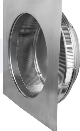
Dimensions & Specifications 144 Sq. in. NFA