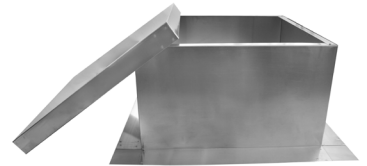
Roof Curb Not Included