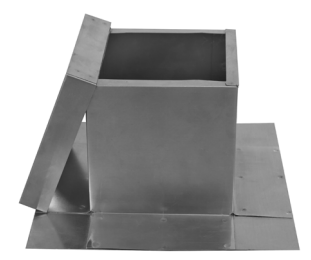
Roof Curb Not Included