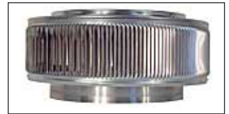
Aura Vent head