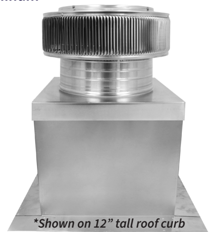
Roof curbs available in 6", 12" and 18" tall