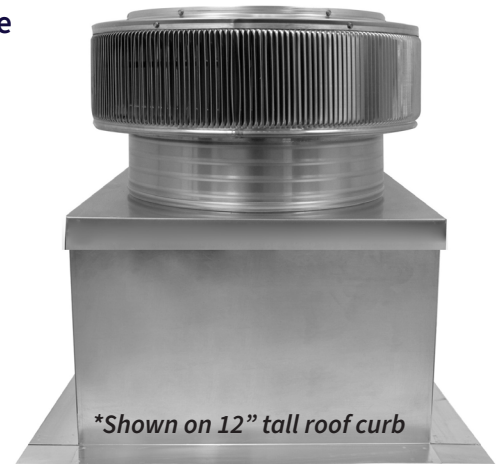
*Shown on 12" tall roof curb