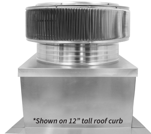
*Shown on 12" tall roof curb