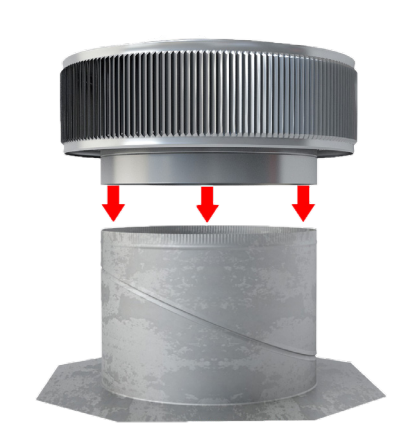
*Base not included