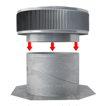
*Base not included