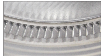
Close up of louvers - Inside