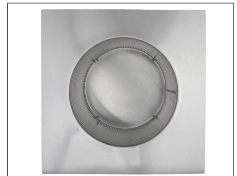
Bottom view of flat base