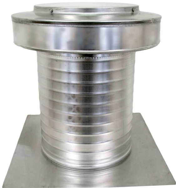
Keepa Vent - an Attic Roof Vent