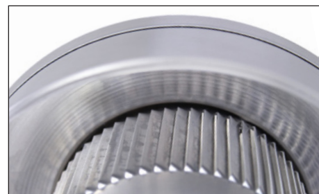
Close up of bug resistant louvers.