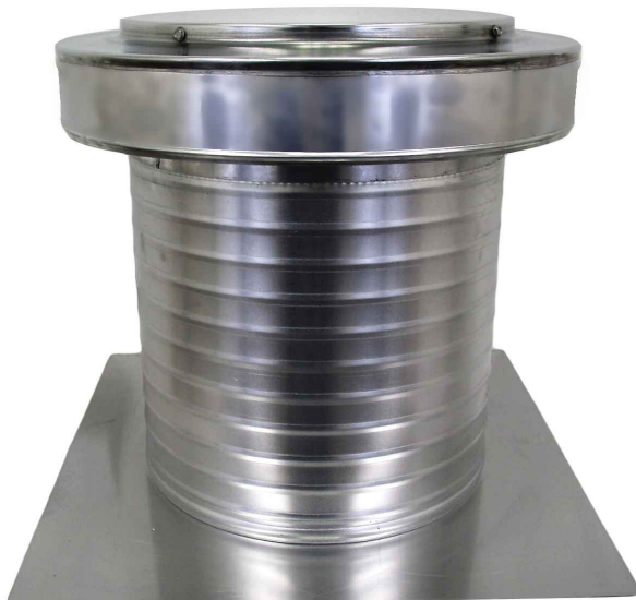
Keepa Vent - an Attic Roof Vent