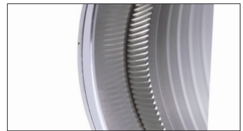
Close up of bug resistant louvers.