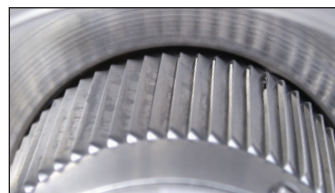
Close up of louvers - Outside