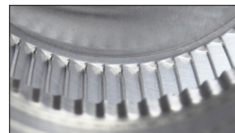
Close up of louvers - Inside