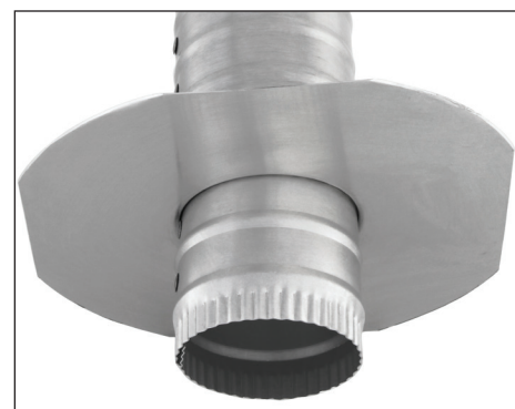
Bottom view of Curb Mount Flange