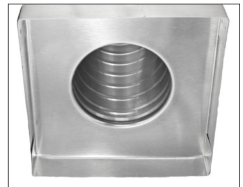
Bottom view of Curb Mount Flange