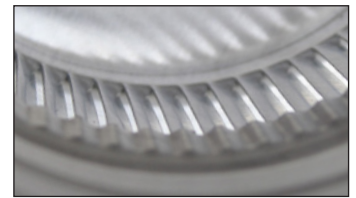
Close up of louvers - Inside