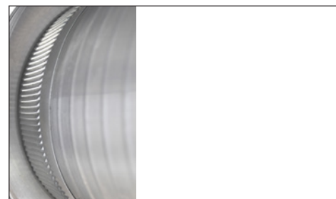
Close up of bug resistant louvers.