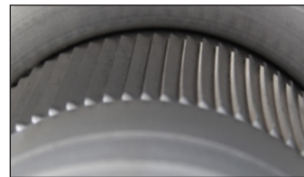
Close up of louvers - Outside