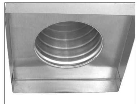
Bottom view of Curb Mount Flange