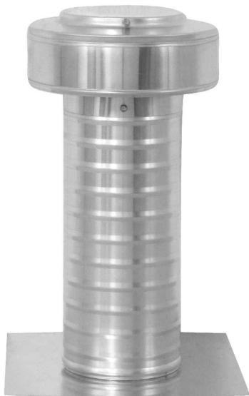
Keepa Vent - an Attic Roof Vent