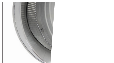
Close up of bug resistant louvers.