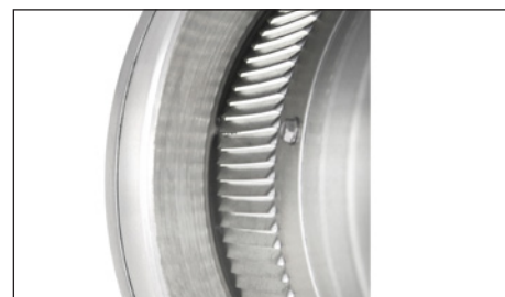
Close up of bug resistant louvers.