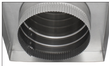
Close up of tail pipe adapter extension