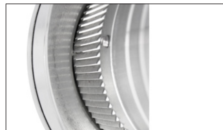
Close up of bug resistant louvers.