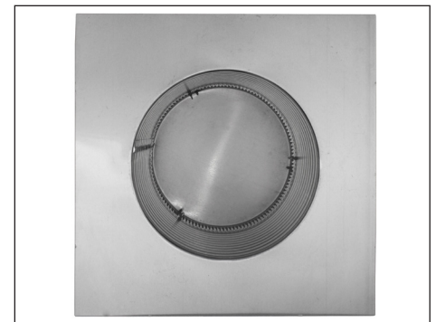
Bottom view of flat base