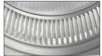
Close up of louvers - Inside