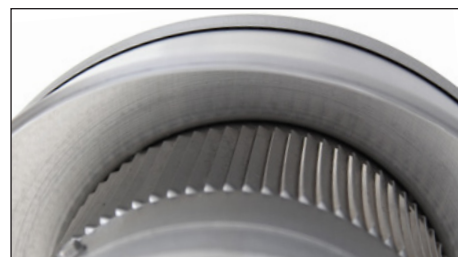
Close up of bug resistant louvers.