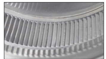
Close up of louvers - Inside