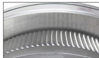
Close up of louvers - Outside