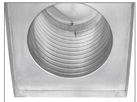
Bottom view of Curb Mount Flange