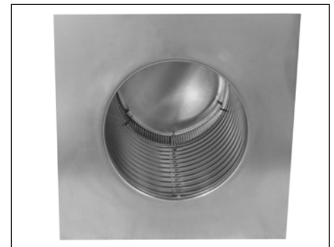
Bottom view of Curb Mount Flange