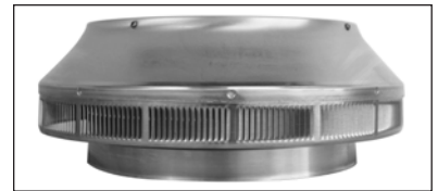
Pop Vent head