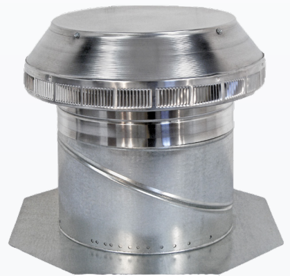
*Base not included