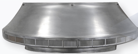
Powder coating available