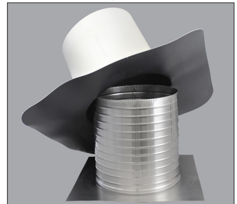
View of flashing going over sub-base