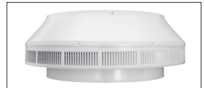
Pop Vent head