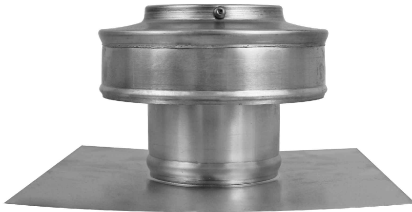
Round Back Roof Vent

Total number of screws needed = 8 (screws not included)