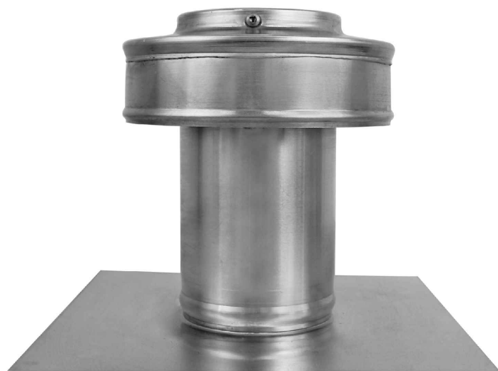
Round Back Roof Vent

Model: RBV-3-C4 Diameter: 3" Collar Height: 4"