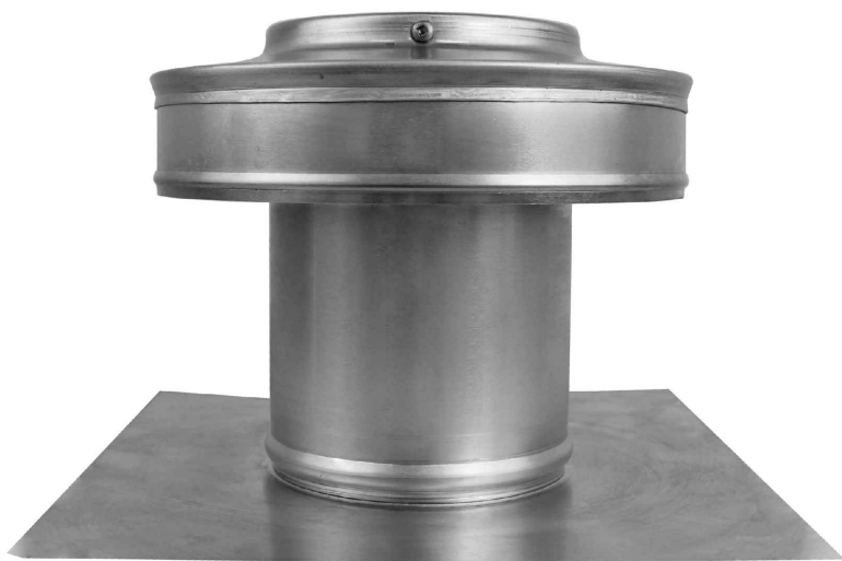
Round Back Roof Vent

Total number of screws needed = 8 (screws not included)