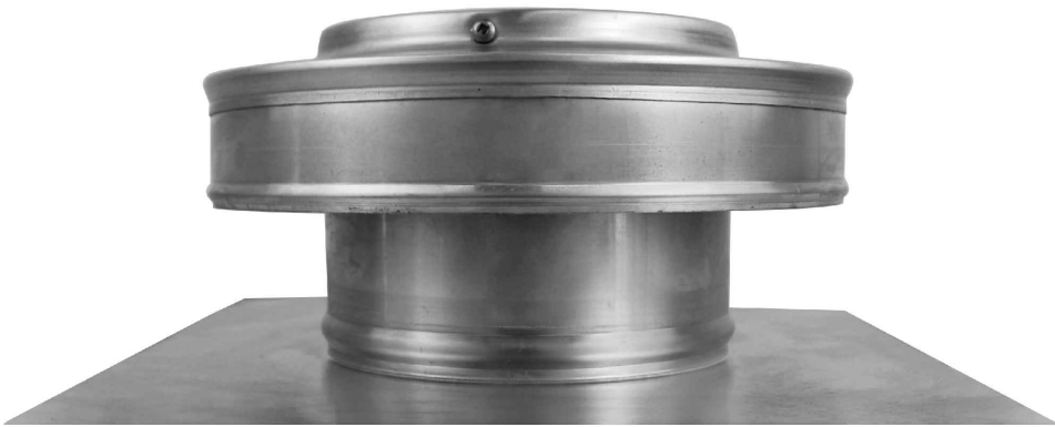
Round Back Roof Vent

Total number of screws needed = 8 (screws not included)