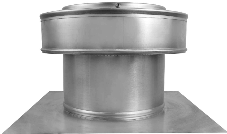
Round Back Roof Vent

Model: RBV-7-C4 Diameter: 7" Collar Height: 4"