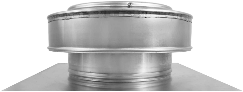
Round Back Roof Vent

Total number of screws needed = 8 (screws not included)