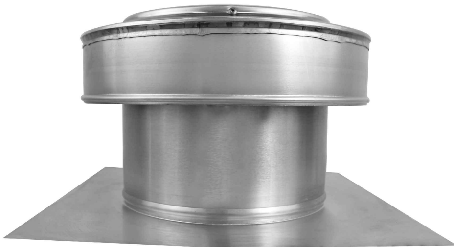
Round Back Roof Vent

Total number of screws needed = 8 (screws not included)