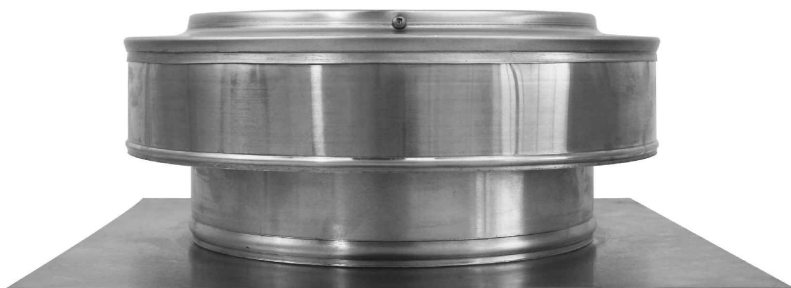
Round Back Roof Vent

Total number of screws needed = 12 (screws not included)