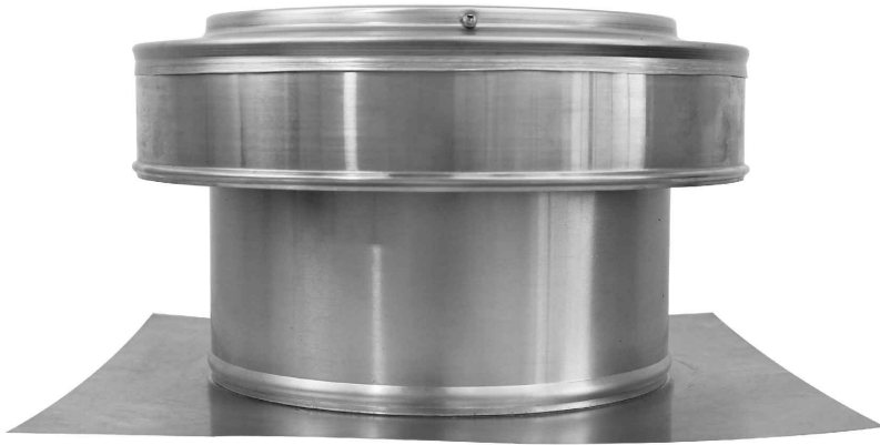
Round Back Roof Vent

Total number of screws needed = 12 (screws not included)