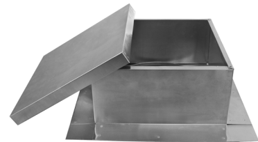
Roof Curb Not Included