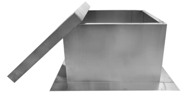
Roof Curb Not Included