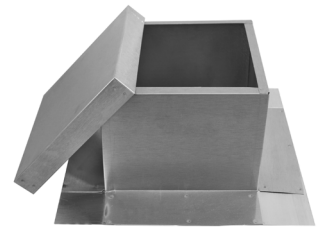
Roof Curb Not Included