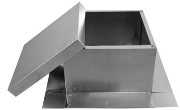
Roof Curb Not Included