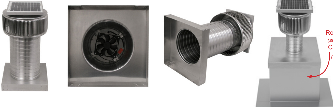
Figure 1: Roof Curb Base (sold separately) Call for specs.

Using both Solar and Wind Power to provide optimal Ventilation and Energy Saving performance