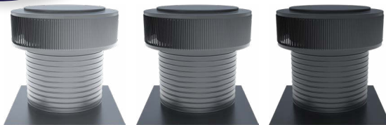
Sample colors (More colors available)