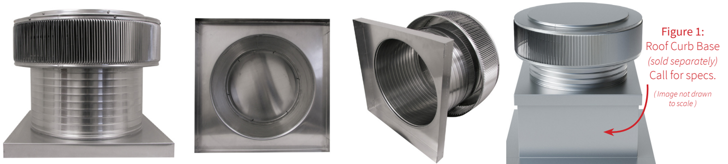
Figure 1: Roof Curb Base (sold separately) Call for specs.

A Roof Vent That Exhausts Air Like a Turbine, With No Moving Parts