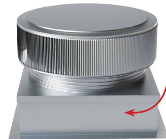
Figure 1: Roof Curb Base (sold separately) Call for specs.